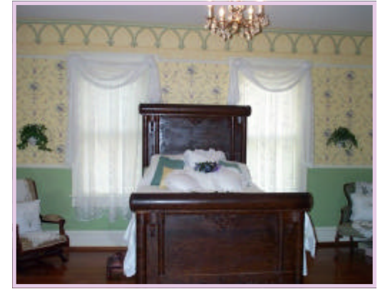
Prepare for your special day in the beautiful bridal room.

Rental includes the entire house (except private rooms) and garden. Four (4) hour time-limit on the wedding day. Use of tables, chairs and silk flowers that are already part of The Hunter House and rehearsal of actual ceremony. Phillip and Linda Doub (Owners) are present to act as hosts and to coordinate parking, catering, etc.